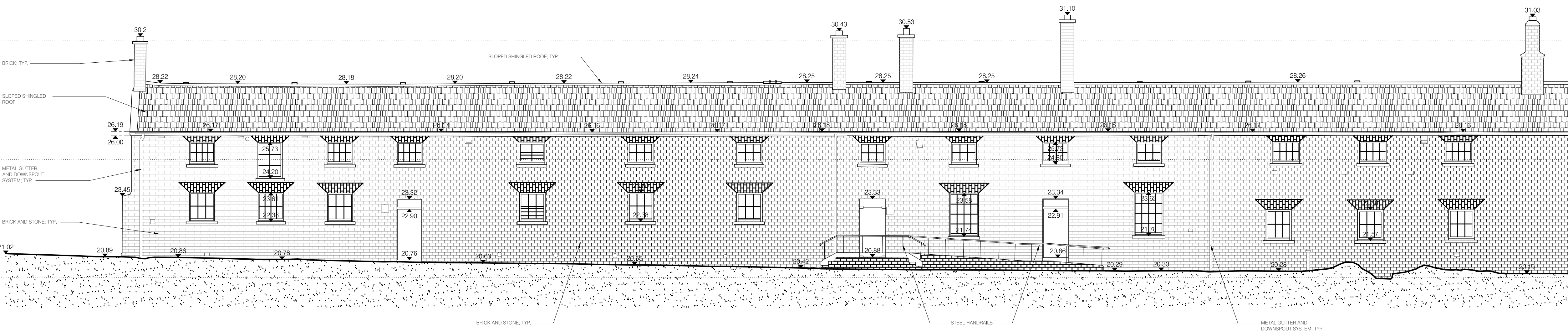
1 HAUGHTON BUILDING - ELEVATION 4A SCALE: 1:100 METERS