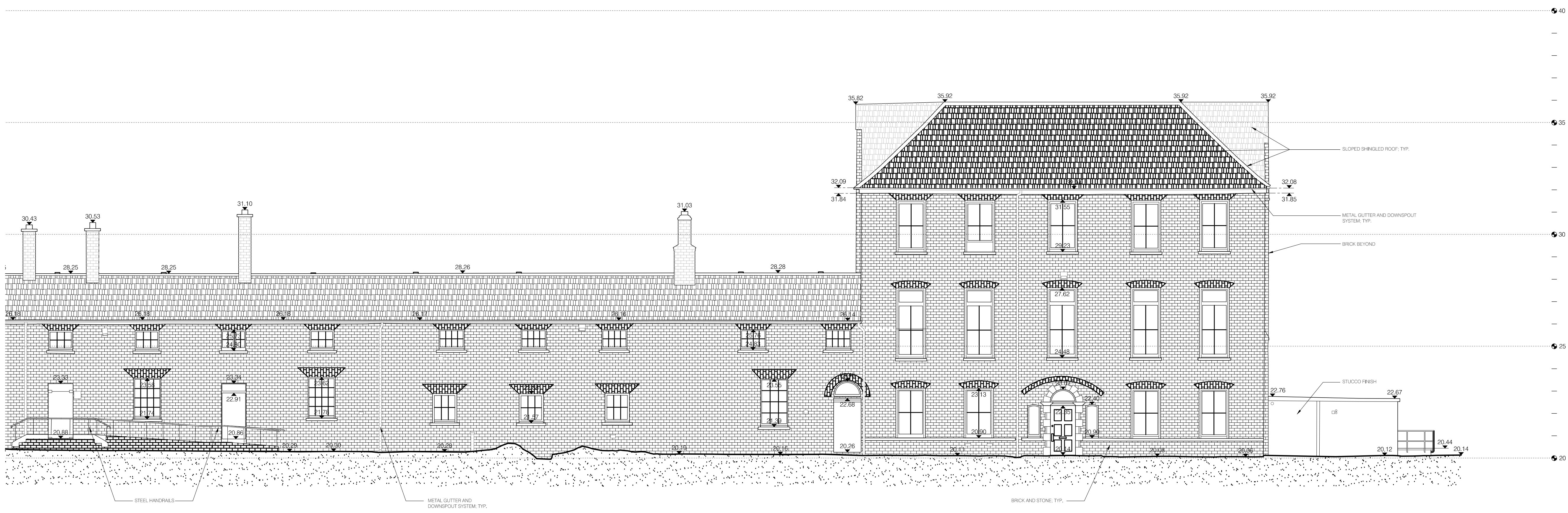
2 HAUGHTON BUILDING - ELEVATION 4B SCALE: 1:100 METERS