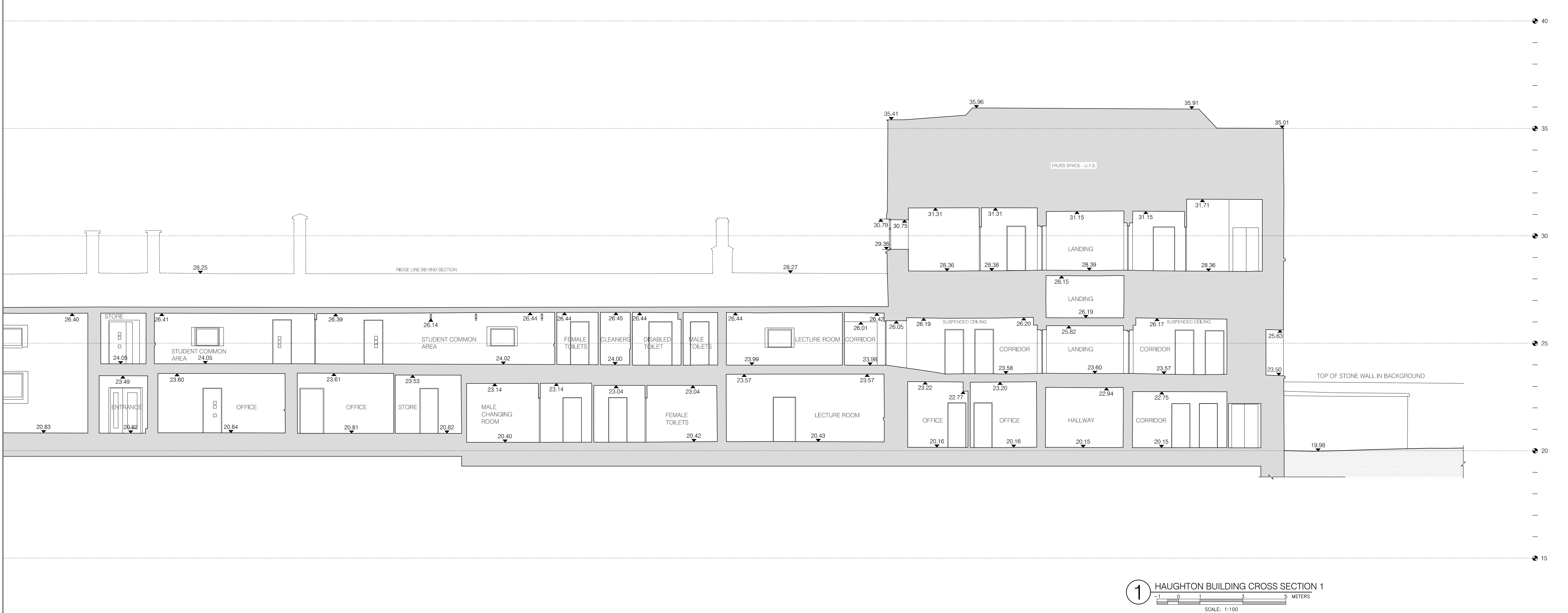
1 HAUGHTON BUILDING CROSS SECTION 1 SCALE: 1:100