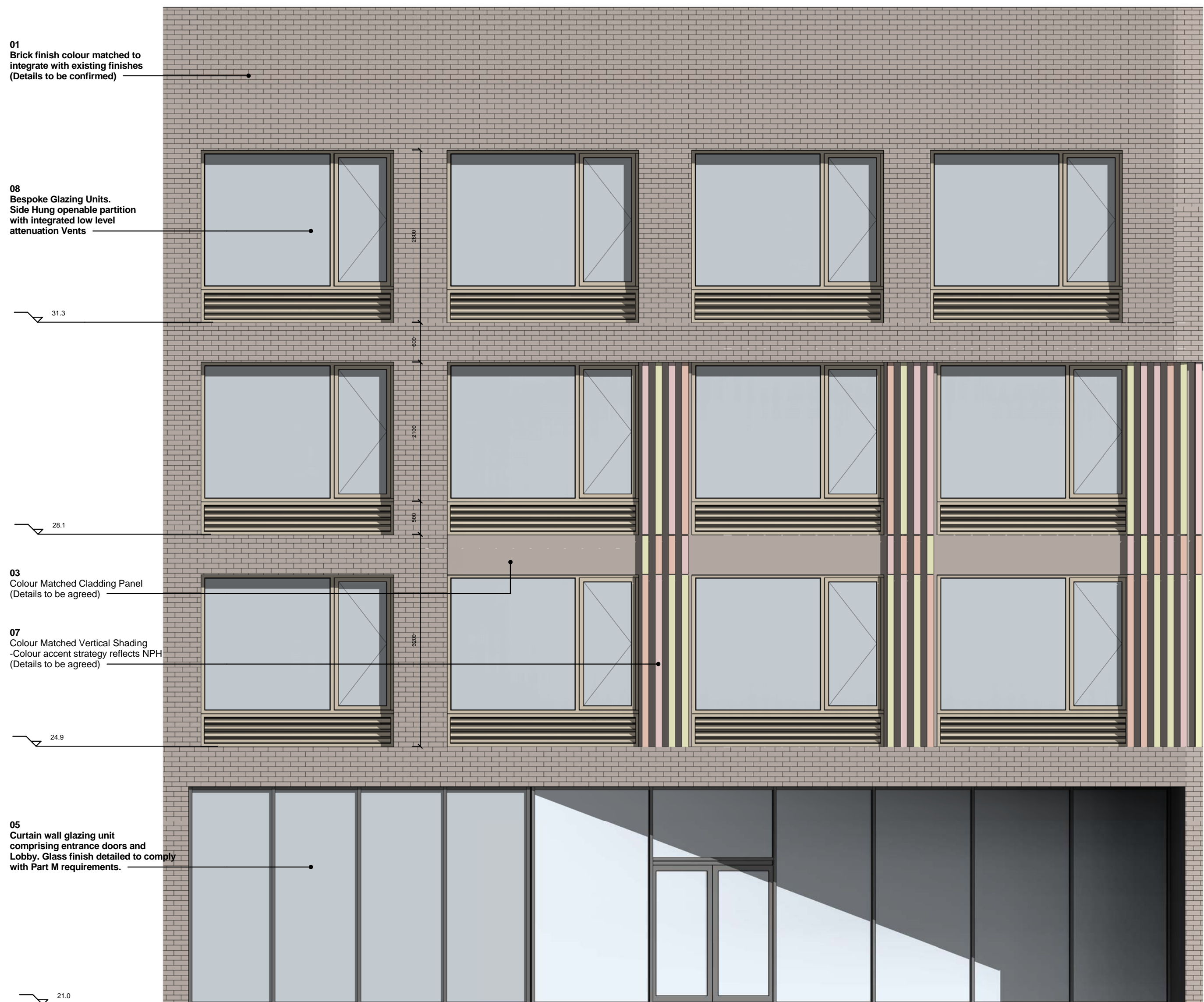
③ Elevation South East 1 : 50

DIMENSIONS IN MILLIMETRES LEVELS IN METRES