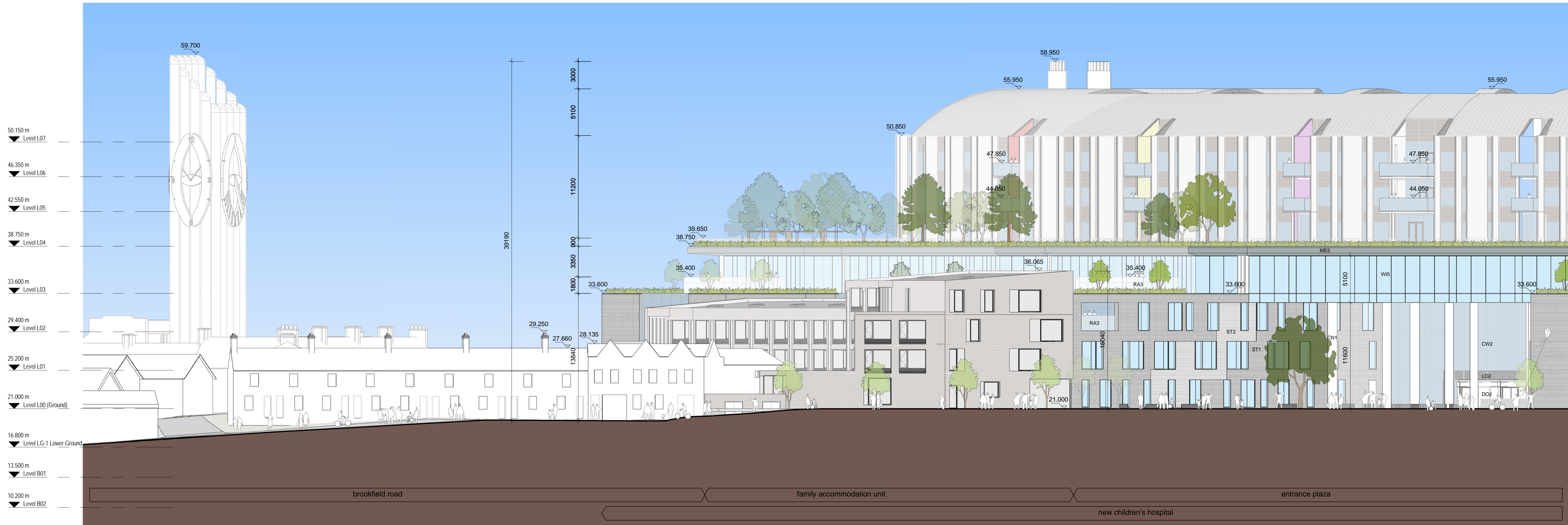
26 BROOKFIELD ROAD ELEVATION 1 : 200