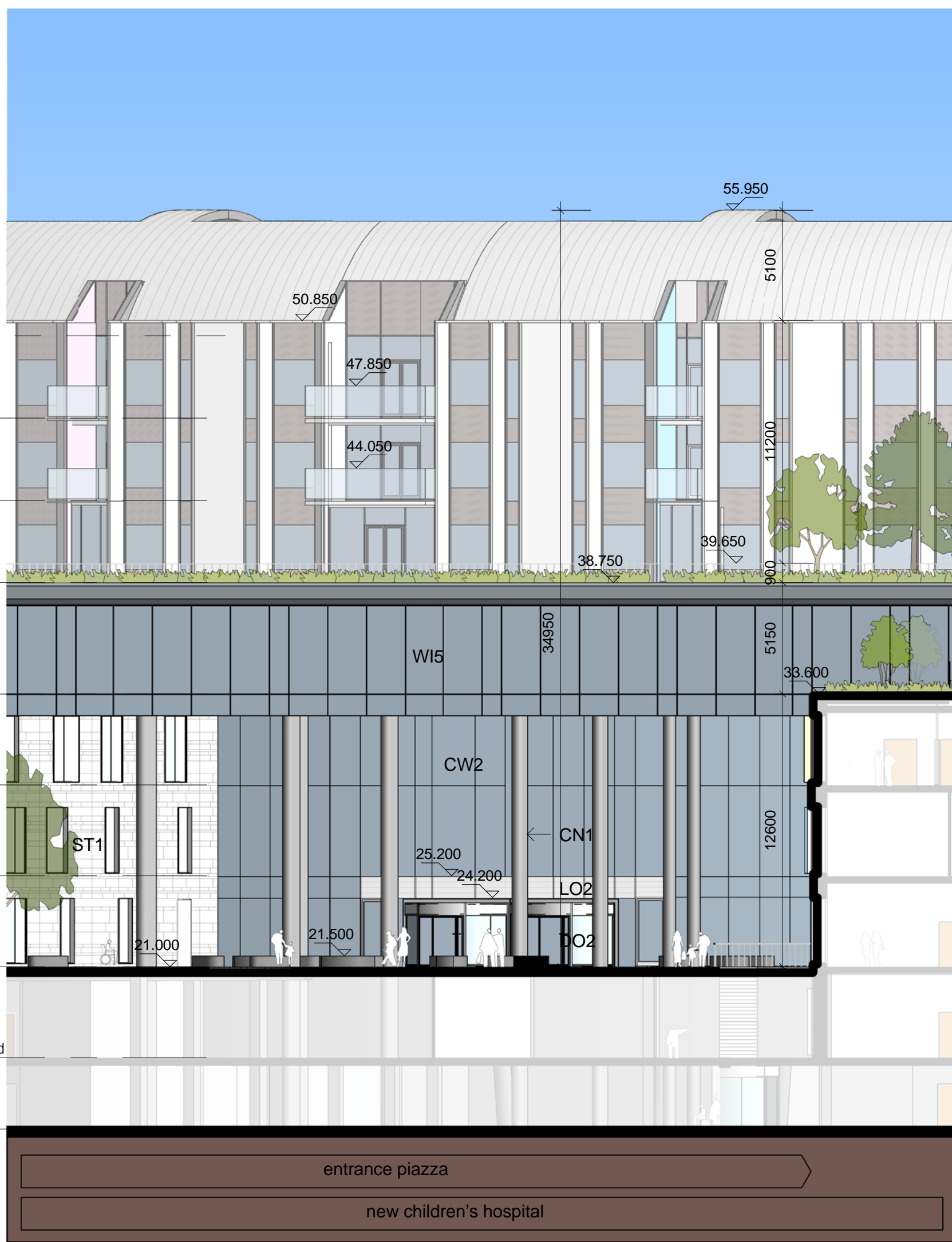
27 WEST PIAZZA SECTION 1 : 200