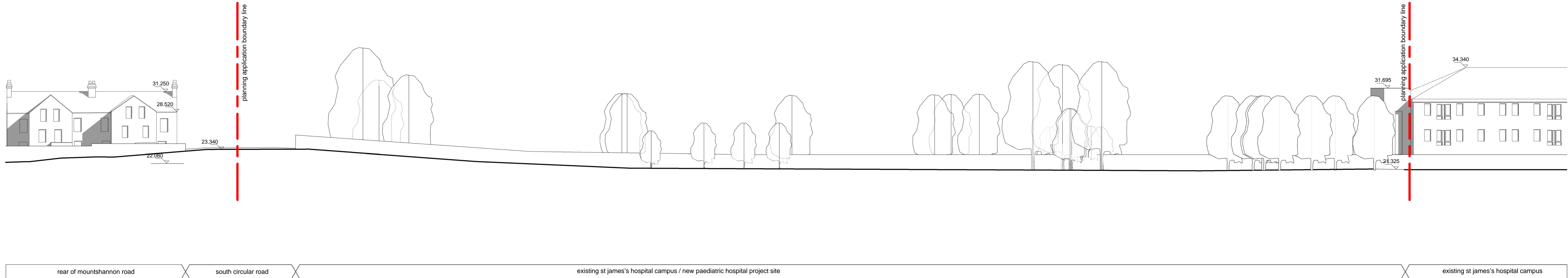
3 EXISTING SITE SECTION 1 : 200 REFER TO SHEET 2207 - 3 FOR CORRESPONDING PROPOSED CONDITION